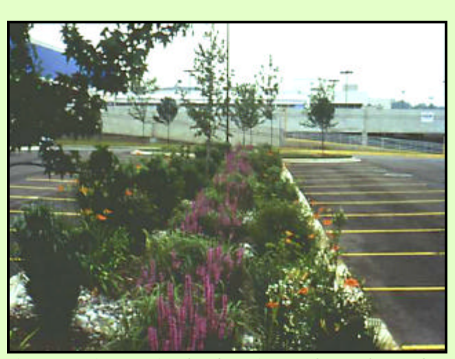
Figure 1. Bioretention landscaping at the Inglewood demonstration project site.

A landscaped island measuring approximately 38 feet by 12 feet was chosen as the retrofit area. The island contains a curb inlet that drains into the municipal storm drain system. Almost the entire drainage area is impervious. A 4-foot slot was cut into the curb immediately before the inlet. The landscaped island was then excavated to a depth of 4 feet. An underdrain was installed and tied into the bottom of the existing inlet to completely drain the planting soil to avoid oversaturation. The underdrain was covered with 8 inches of 1- to 2-inch gravel and backfilled with typical bioretention soil mix. The backfill extended to a depth of about 12 inches below the top of the curb, which allows for a ponding depth of approximately 6 inches of water in the island